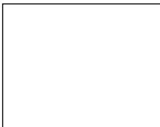
Photograph of authorized representative attested by the candidate

Signature of the authorized representative duly attested by the candidate